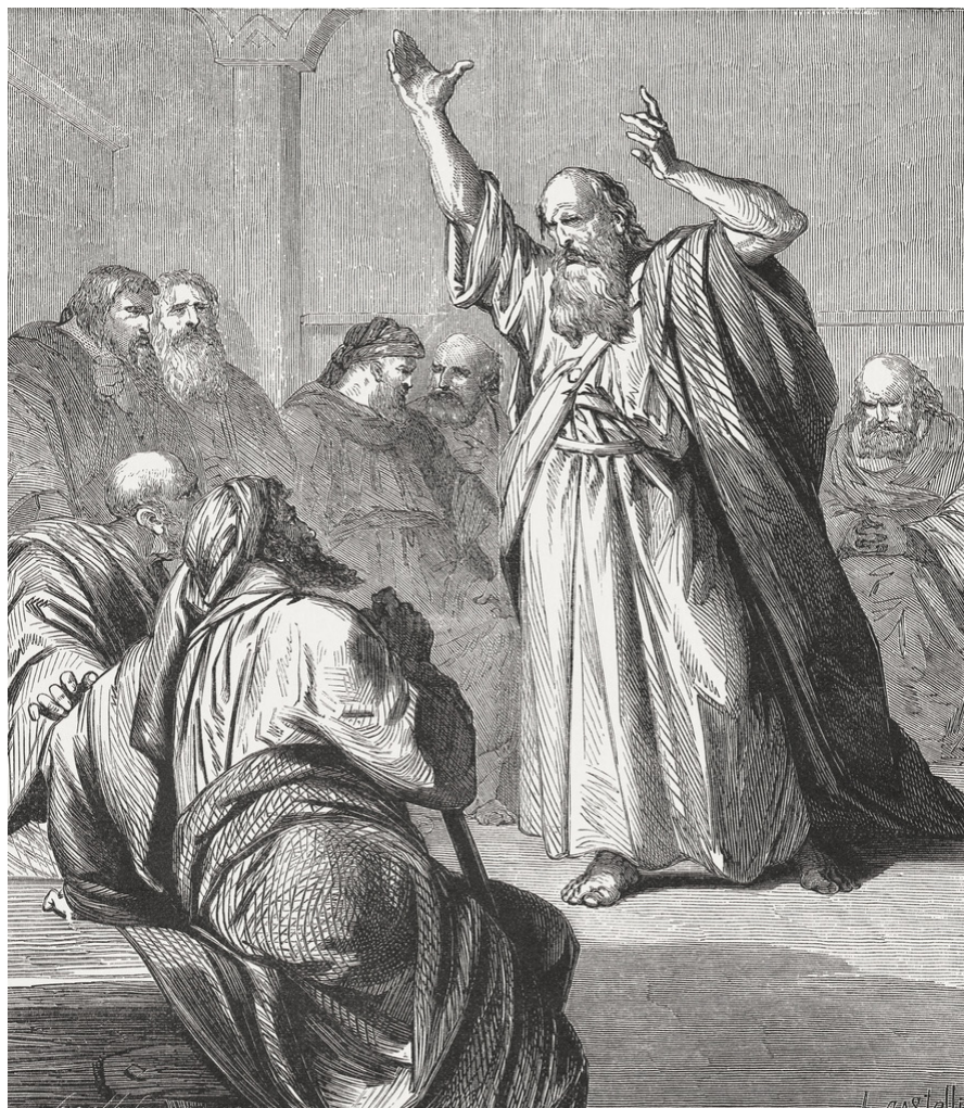
Ezekiel prophesied to the elders of Israel (Ezekiel 14). Wood engraving by G. B. Castello, published in 1886.

“Ezekiel”?! The very name conjures up thoughts of an Old Testament prophet railing against a sinful nation. A man whose message is studded with condemnations and wild visions unable to be understood. Warnings about lengthy periods of intense death causing diseases, famines, slavery. Mysterious visions about chariots, rods, Gog and Magog, a millennial temple. What do all these mean? Why should a Church of the twenty-first century take the