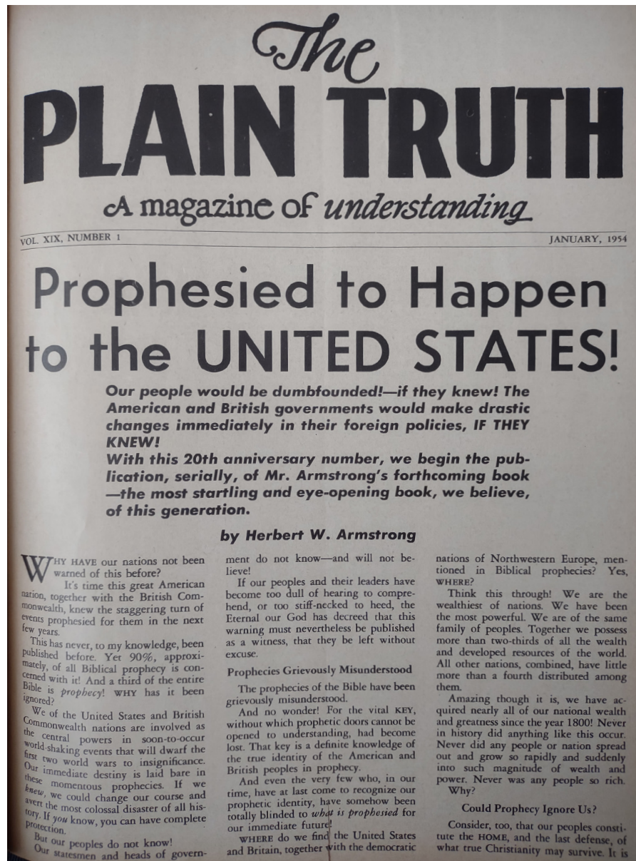
Warning the world of what is to come and educating nations about the source of their blessings was a common theme of Herbert W. Armstrong’s work.

a nice social club each week at church services” approach. We, of all people, have a duty of care and a burning desire to warn our peoples. Otherwise, our indifference will be noted by God and we will pay the consequences. Matthew Henry’s Commentary , written in the 18th century has an excellent message for us in this regard: “Lukewarmness or indifference in religion is the worst